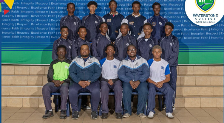
The King`s School West Rand Boys U19