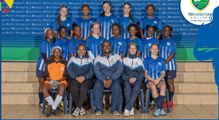
The King`s School West Rand Girls U19