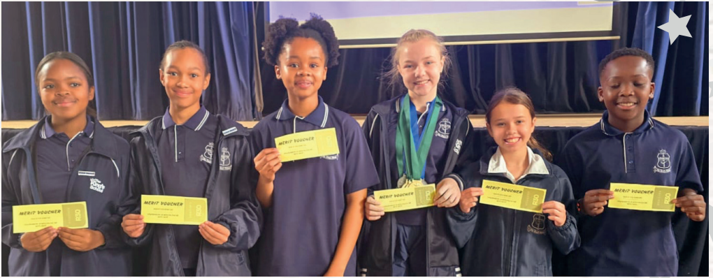
These Grade 6 learners were awarded a Tuck voucher for their exceptional effort in attaining individual merits last term. CONGRATULATIONS!