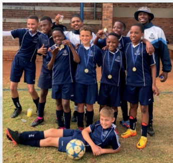
LEFT: U10 SOCCER BOYS RIGHT: U12 SOCCER BOYS