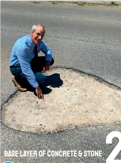
BASE LAYER OF CONCRETE & STONE