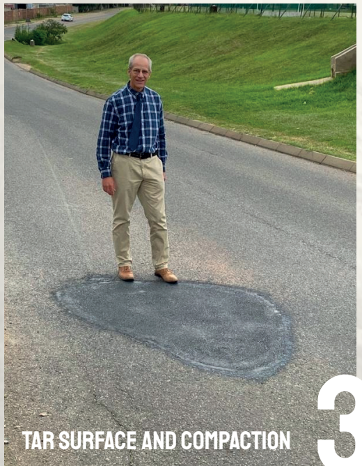
TAR SURFACE AND COMPACTION