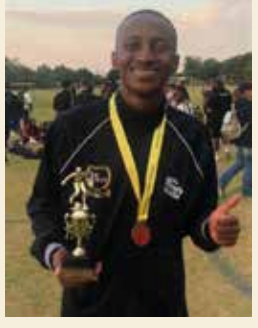
Please note we will be hosting the SACSSA JUNIOR SIX-A-SIDE SOCCER TOURNAMENT at TKSWR on Saturday 28 May 2022 with our U9, U11 and U13 teams competing.

Please Note: In case of absenteeism a doctor's note must be provided for all summative assessments (tests, orals, practical assessments etc) missed.