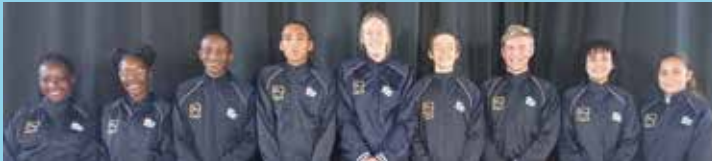
THE CAPTAINS AND VICE-CAPTAINS OF THE TEAMS.