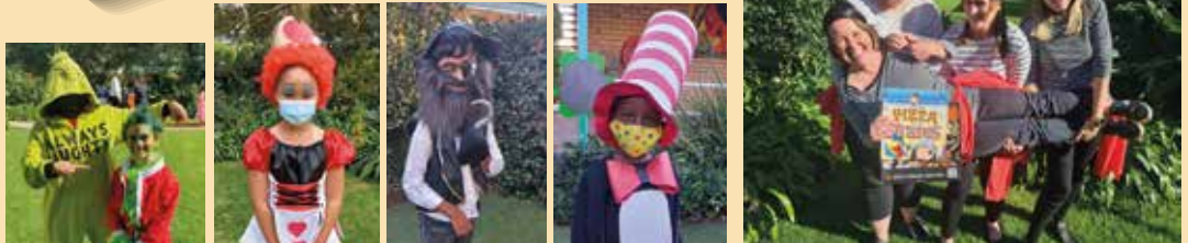
Grade 1 teachers dressed up as pirates! "Aaaaaaar matey"

The Primary School took part in the Book Parade on Friday 22 April. We would like to thank each learner who took part in our book parade and for the donation of about 130 books. These books will be donated to needy schools.