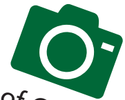
Photo of Chess Team on the back cover!

We thank all our chess children for taking part in the competitions throughout the year. This was the last one for 2016. We are looking forward to a great 2017 as well!